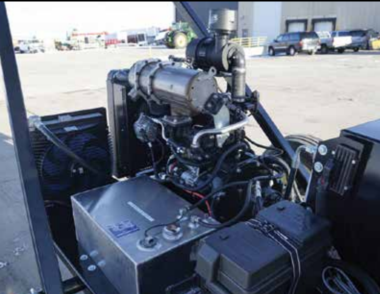
▲ 45HP Tier IV Final Yanmar Diesel Engine and Hydraulic Cooling Package

2247 Field Loader with Diesel Powered Self Propelled Kit