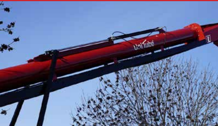
▲ Hydraulic Lift Cylinder