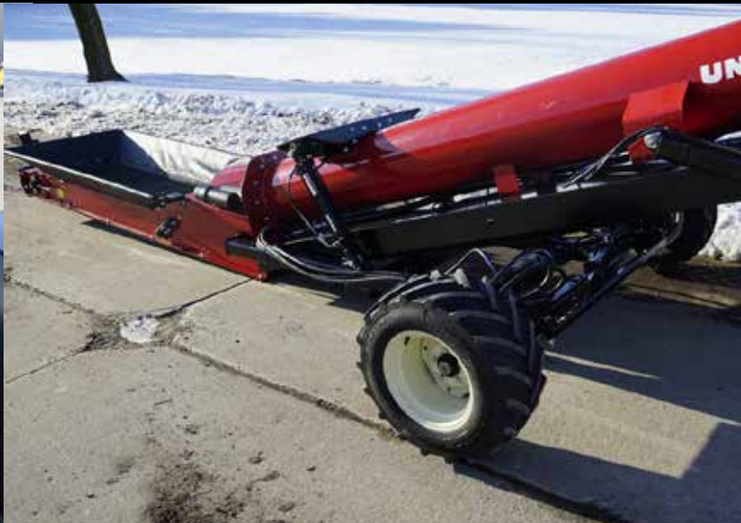
▲ Hydraulic Wheel Mover Kit with Brake Motors