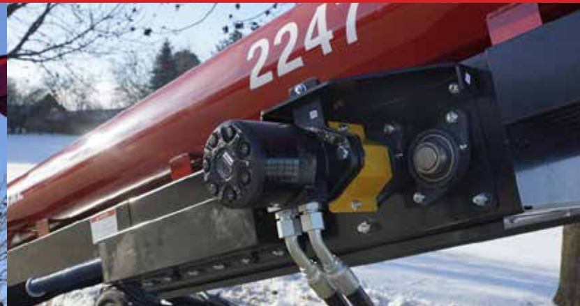
▲ Hydraulic S-Drive